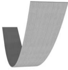
GM-NEWZ-125x3LB 125mm Height Garden Edge Strip