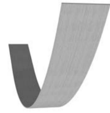
GM-NEWZ-100x3LB 100mm Height Garden Edge Strip