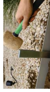
Drive Fixing Pegs