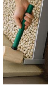
Secure Strip End