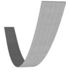
GM-NEWZ-80x3LB 80mm Height Garden Edge Strip