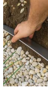
Adjust Strip Height