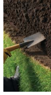
Cut a Neat Trench